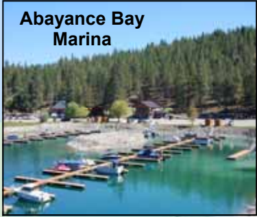
Abayance Bay Marina

Mariners Haven, PH 3, Lot 36, 0.163 Acres, *21955* S11, T36N, R28W